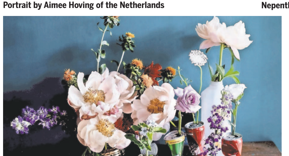
SEE FLORALS, 2B